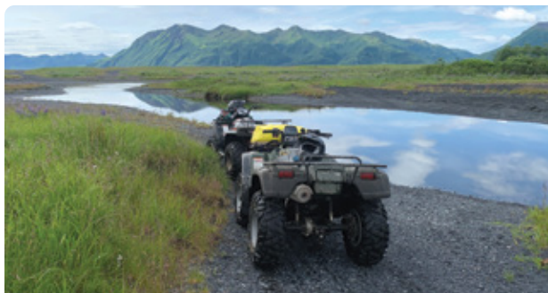
Some fishing spots require an off-road drive.