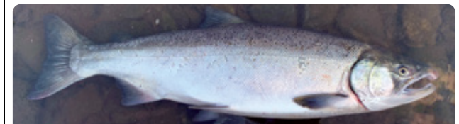
Dime bright coho salmon.