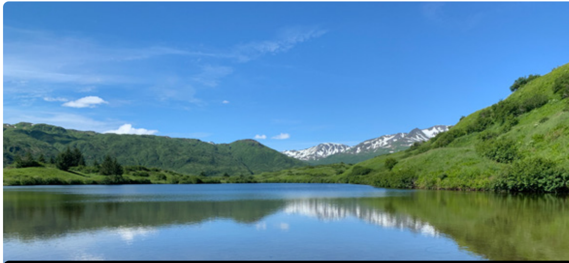
Aurel Lake on a beautiful summer day.