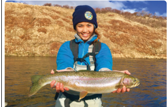
Chunky steelhead trout from Karluk River.