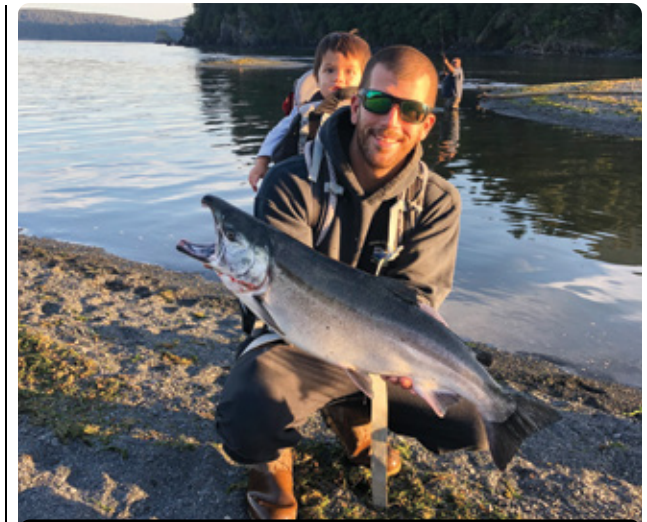
Take your kid fishing with you. Teach them young.