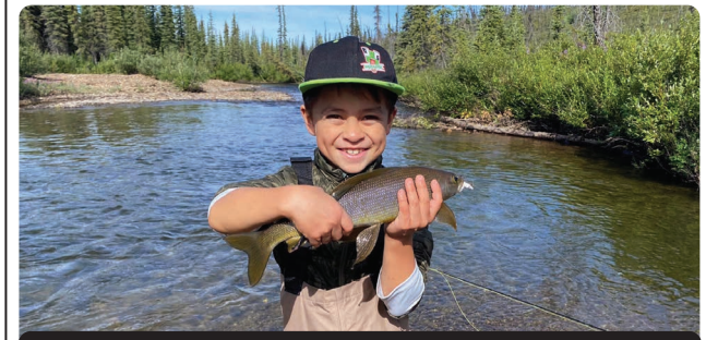
Happy young angler with their catch.