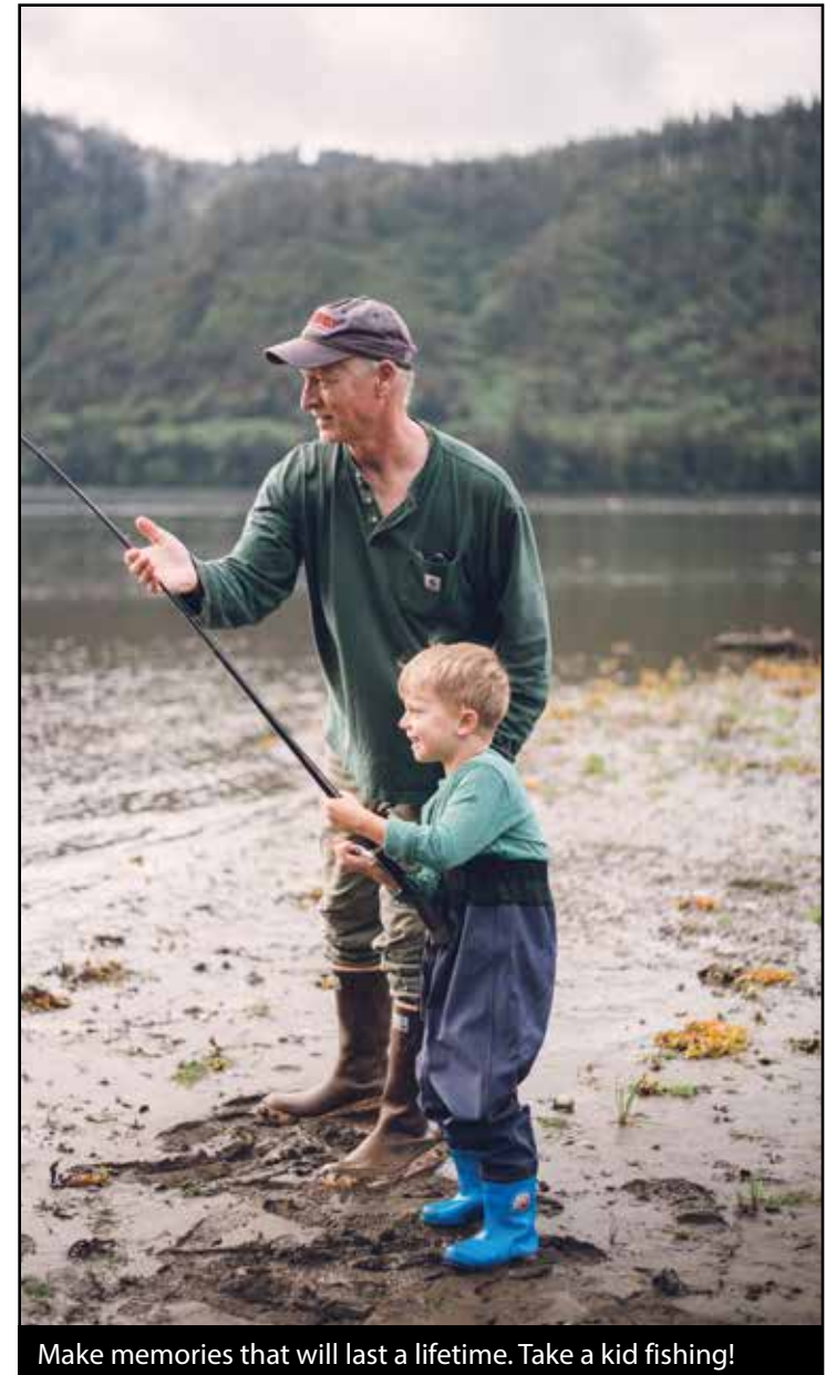
Make memories that will last a lifetime. Take a kid fishing!