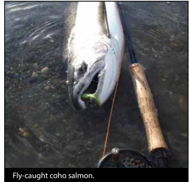
Fly-caught coho salmon.