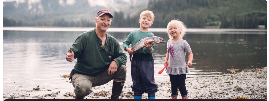
Hooked on fishing.

IF YOU HAVE ANY QUESTIONS, PLEASE CONTACT THE HAINES AREA OFFICE AT (907) 766-3638