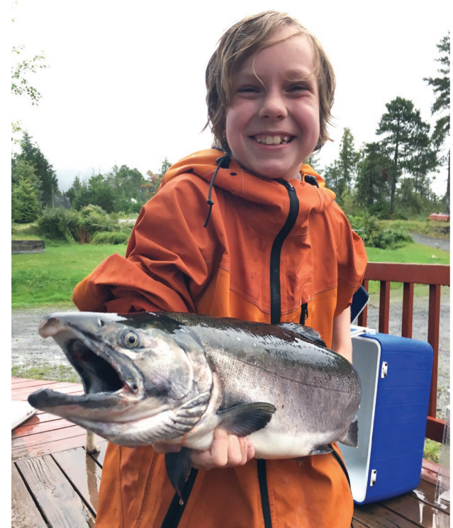
A young angler and their catch.

GET THE LATEST FISHING INFO EMAILED TO YOU. SIGN UP ONLINE AT WWW.WEFISHAK.ALASKA.GOV .