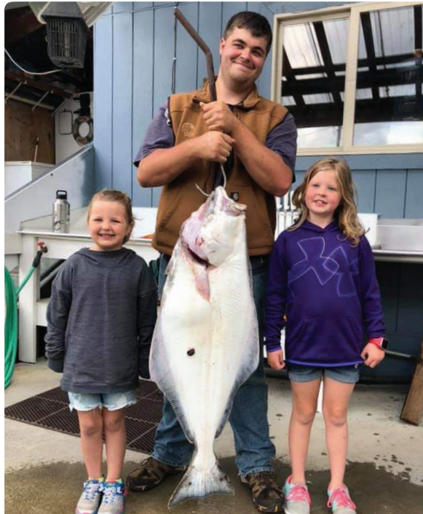
When your catch is as big as your kiddos!